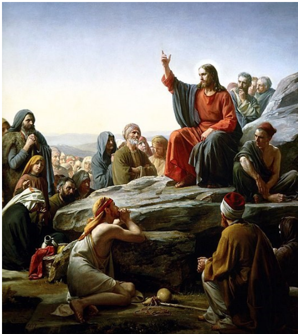
Sermon on the Mount Carl Bloch (1834-1890)

Each year, Christian churches in America partake in a weeklong ecumenical prayer for Christian unity. It began on January 18 th and will conclude on January 25 th . This ties well into our New Testament epistle (second reading) this weekend from St. Paul's first letter to the Corinthians, where he urges his Christian brothers and sisters that there may be no divisions among them. We see many divisions today budding anew, even within the Catholic Church. We must remember that division is a work of Satan and the evil spirits, and that united we can accomplish Christ's work for his kingdom much more fruitfully. In honor of this week of prayer for Christian unity, we remember that wonderful prayer that Our Lord Jesus Christ prayed to his heavenly Father.